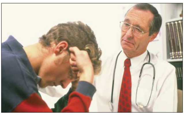
Reassure young people about confidentiality during face to face consultations

It is worth telling young people and their parents how they can a register as a temporary patient